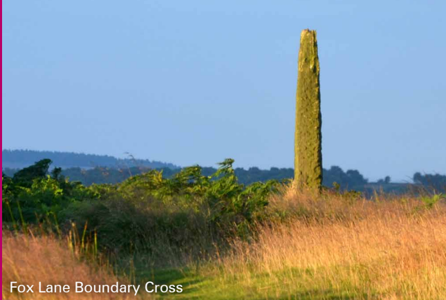
Fox Lane Boundary Cross