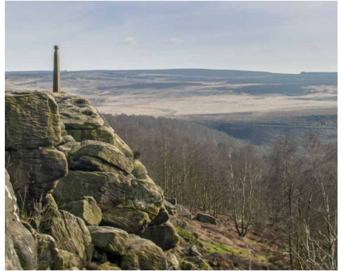
Lord Nelson's Monument

of you. 6 ▶ Turn left through the gap in the wall and follow the path all the way down the field – which is scattered with evidence that it was once a Bronze Age settlement – until you reach the stone step over stile in the wall by the main road. 7 ▶ Go over the stile and turn left, following the pavement until it takes you back to Birchen Edge car park.