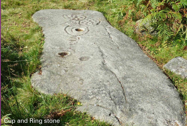
Cup and Ring stone