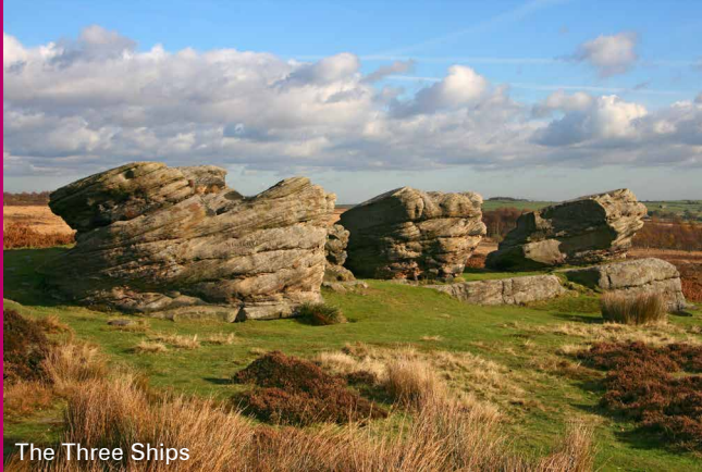
The Three Ships