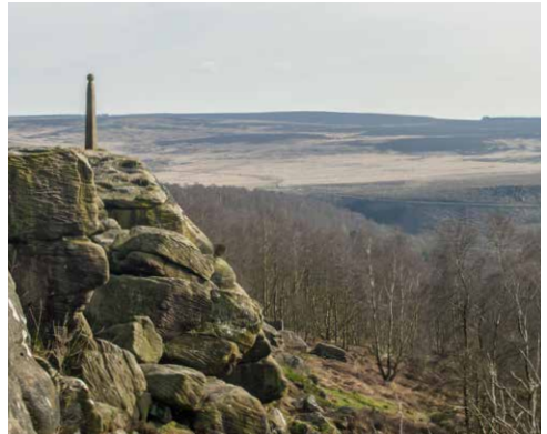
Lord Nelson's Monument

of you. 6 ▶ Turn left through the gap in the wall and follow the path all the way down the field – which is scattered with evidence that it was once a Bronze Age settlement – until you reach the stone step over stile in the wall by the main road. 7 ▶ Go over the stile and turn left, following the pavement until it takes you back to Birchen Edge car park.