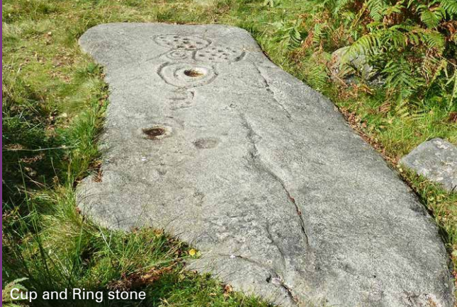
Cup and Ring stone