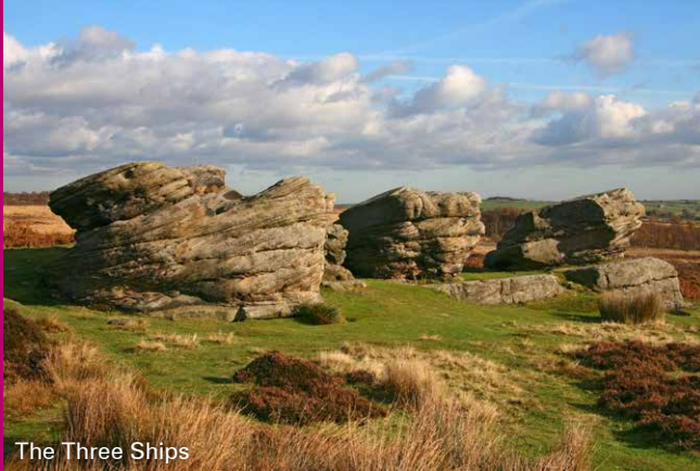
The Three Ships