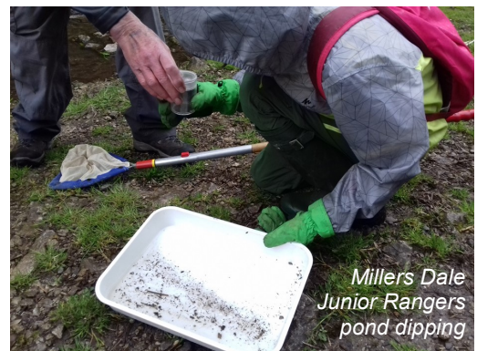
Millers Dale Junior Rangers pond dipping

If not, then National Volunteers Week 2019 (1st-7th June) is the perfect time to do it, and the #iwill campaign are supporting this through Youth Social Action Day on 5th June. The #iwill campaign is asking young people to make pledges to take action to make their society and environment better. This can be something as small as cutting down your plastic waste, to something big like joining a young ranger group!