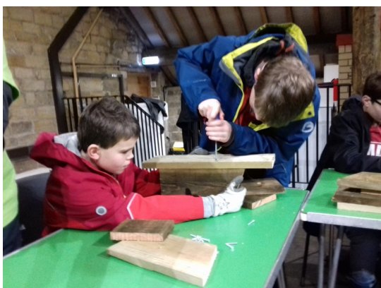
Langsett Junior Rangers making bird boxes

The Peak and Parks young rangers are all part of this movement through their amazing contribution to care for the environment. Here are some quotes from them about taking social action to help the environment: