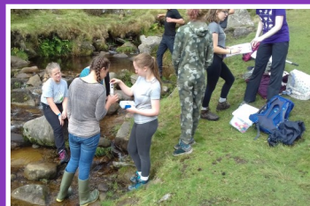
Young Rangers from all groups studying Grindsbrook on the 2018 residential.

See the back page for locations and contact details if you are interested in joining.