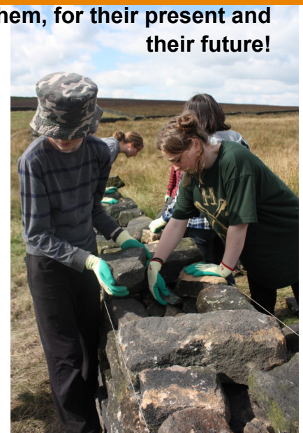
Youth Rangers building a drystone wall, an important heritage skill in the Peak District

But it's not all hard work! There are usually about 15 Youth Rangers each month working on the Eastern Moors. Some of them have been coming for years, and some only a month or two, but they all get along and work as a team to get the job done. We always stop for a brew and biscuit break, with some Youth Rangers even bringing along home baking to share with the group!