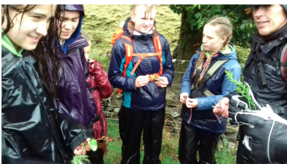
The conditions might not always be excellent, but the Youth Rangers carry on regardless

Being part of a Young Ranger group can provide any opportunity you can imagine. Last year one of our Youth Rangers went to an international conference in Scotland and met some leading conservationist – all funded by the group! So join today and you never know where it might take you.